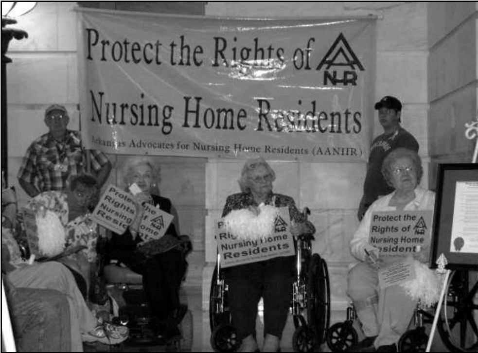
Lonoke Nursing Home Residents