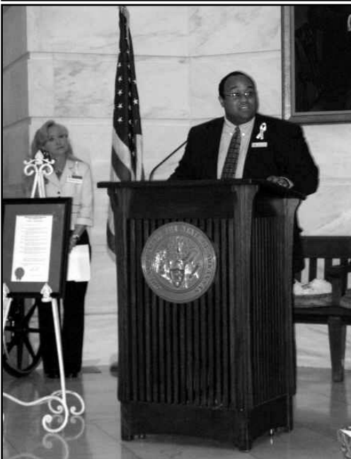
Fifth Annual Residents' Rights Rally