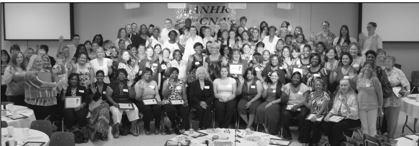
Honored CNAs at the Fifth Annual CNA Award Luncheon