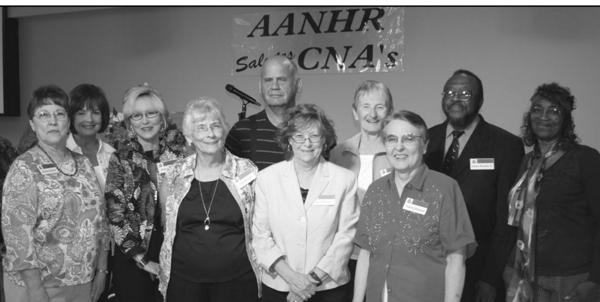
Some of the AANHR members at the 2009 CNA Appreciation Awards Luncheon