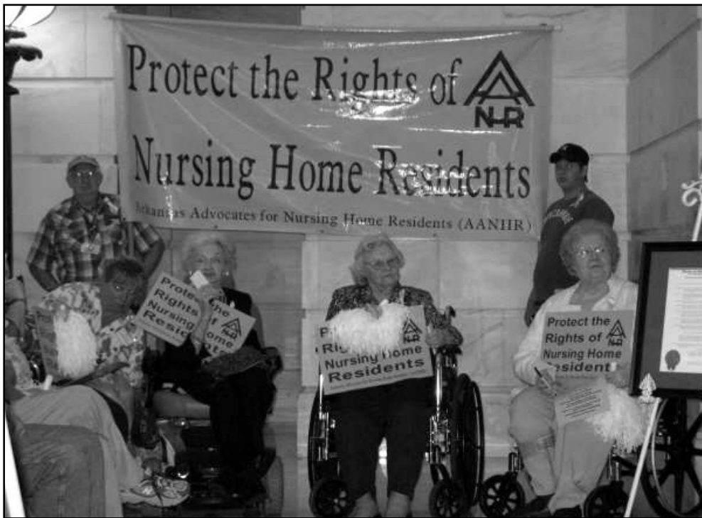
Lonoke Nursing Home Residents