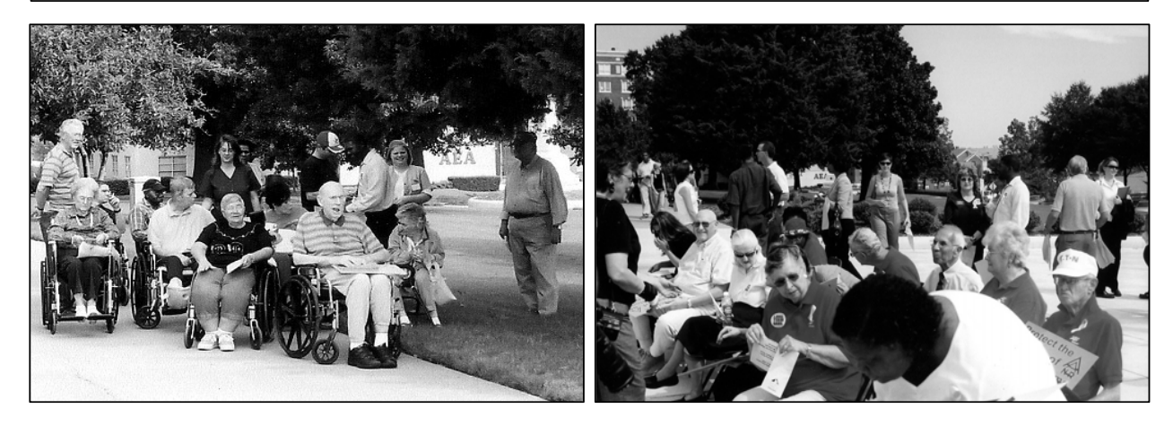
Residents and advocates rally on the Capitol Grounds.

AANHR members were very pleased to see a group of residents from a Lonoke nursing home who were brought to the capitol by staff members. We salute the residents and the wonderful staff who made it possible for them to be there. We hope that as we continue the tradition of holding this rally each October, we will see other homes bringing residents to the capitol to be honored.