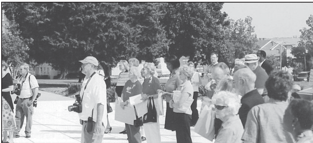
Residents' Rights Rally Attendees