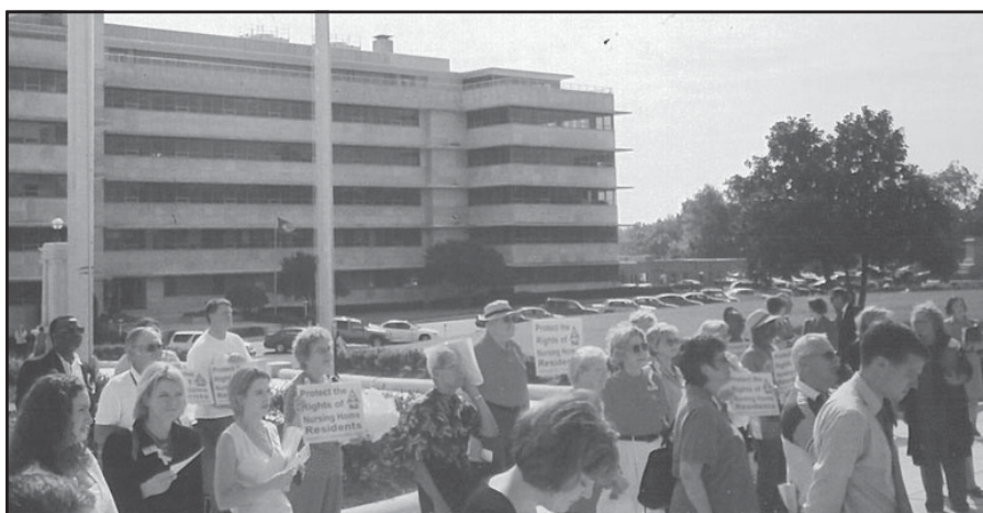
Residents' Rights Rally Attendees