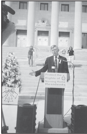
Atty. Gen. Mike Beebe