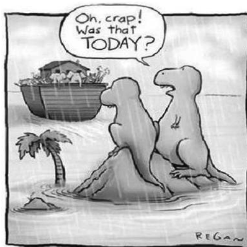
How Dinosaurs became extinct. The very first "senior moment"