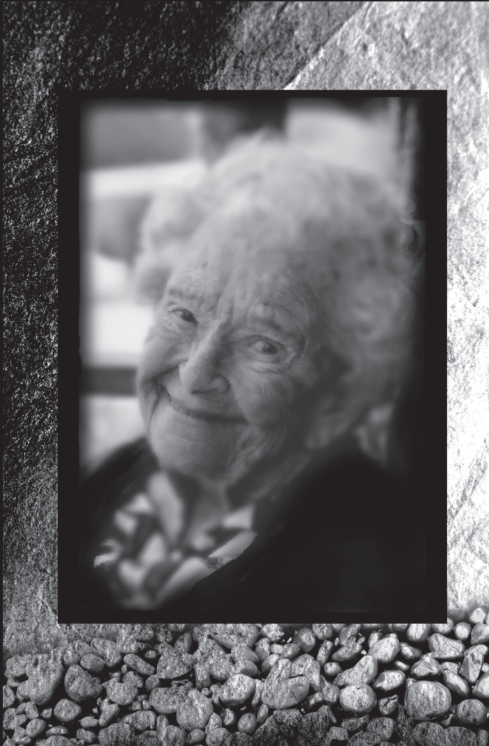
Protecting and improving the quality of care and life for residents in Arkansas nursing homes